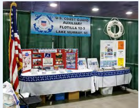
The beautiful Flotilla 12-3 booth at PSC.